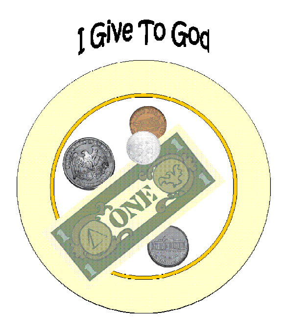
God loves a cheerful giver. 2 Corinthians 9:7

Alternate: give the children some coins to tape onto the "collection plate". Pennies or other small coins work fine.